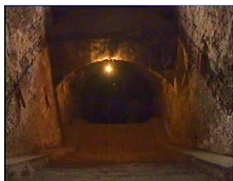
The Communist Jilava Prison. Entrance to the underground cells.

The elect of God stand unafraid. They resist in spite of severe torture. Christ will conquer and not Satan. The latter has the power of death (Hebrews 2:14) but Jesus has the power to resurrect.