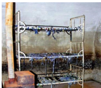
Prison cell with bunk-beds with no mattress, prisoners were obliged to sleep on. Stove for show only, never heated in cold winters.